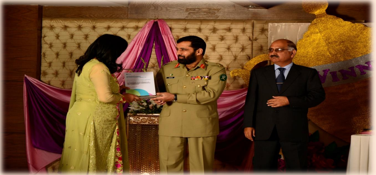
Best School Award Junior School